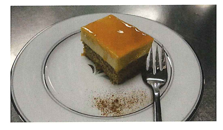
Shown here ready to eat!